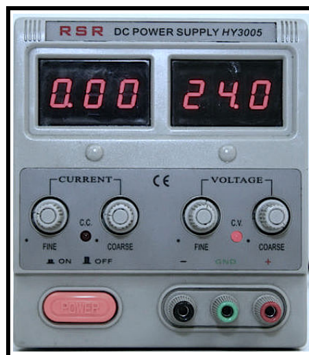
Figure 02.1: the front panel of the HY3005 dc power supply.