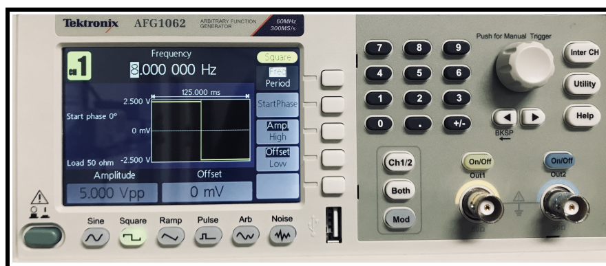
Figure 02.2: the front panel of the Tektronix AFG1062 function generator.

The nominal voltage displayed on the front panel of the function generator assumes some specific load , typically either 50\ \Omega or an infinite resistance. When working with a function generator, either consult the manual or measure its actual voltage output.